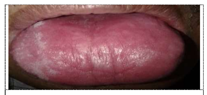
Figure 1. Papila filiformis and fungiformis atrophy on the dorsum of tongue