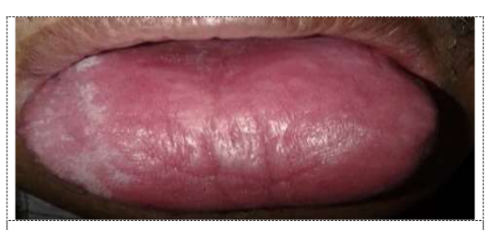
Figure 1. Papila filiformis and fungiformis atrophy on the dorsum of tongue