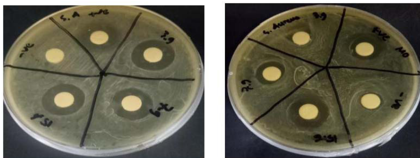
Figure 3 Antibacterial activity of M. oleifera freeze dried extract on staphylococcus aureus (agar diffusion method)

are reported to justification for the action of anti-microbial activity. 22,23 Saponins played the role to inhibit bacterial growth under cultural condition. Increase of definite action of phosphofructokinase (PFK) and isocitrate dehydrogenase (ICDH) was equivalent with stress response and feedback to pathogenic attack of several bacteria. 24 One constituent, tannins, has been tested to inhibit Staphylococcus aureus . 25 The antibacterial mechanisms of tannins through 3 ways; (i) the astringent property that can encourage complexity, many microbial can be inhibited when exposed with tannins, (ii) its activity on the bacterial membrane, and (iii) complexation of metal ions of tannins which may become toxicity. 26