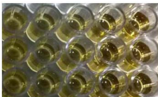
Figure 1 Antibacterial test of moringa oleifera on staphylococcus aureus (96 well plate) first well is medium + bacteria, next well drug with low doses (0.5) to high doses (3.9). Last well is medium

Agar diffusion method; the antibacterial activity of M. oleifera samples used paper disc diffusion method. The liquid broth was obtained by using following procedure. 3.9 g Nutrient Broth (NB) was added by 300 mL distilled water and mixed with 4.5 g Nutrient Agar. The mixing solution was liquefied in autoclave for 20 minutes. Each 15 ml mixing solution was positioned in petri dish. The petri dishes were left in the UV light for 24 hours.